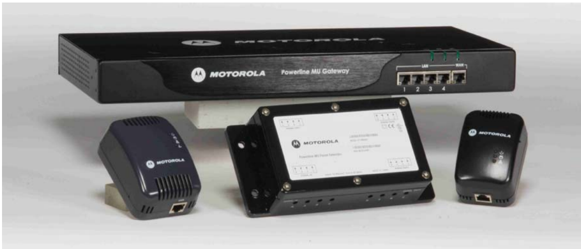
Powerline MU Solution

Please refer to Motorola's ordering instructions to select equipment best suited for the customer's electrical configuration. You can also visit http://www.canopywireless.com for more information.